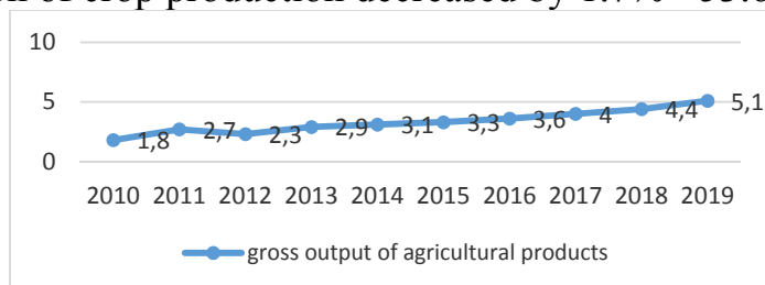
Fig.1. Dynamics of gross agricultural output from 2010 to 2019 (trillion tenge) [1]

Meanwhile, the production of livestock products increased by 4% and amounted to 45.6%, the production of crop production decreased by 1.7% - 53.6%.